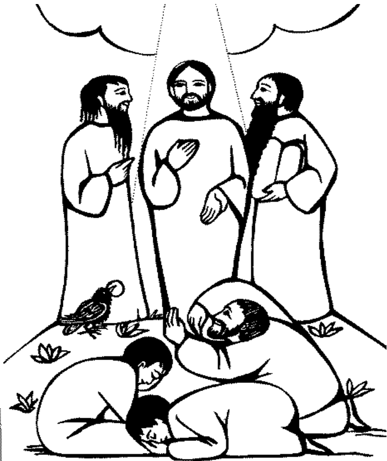
Transfiguration of Jesus